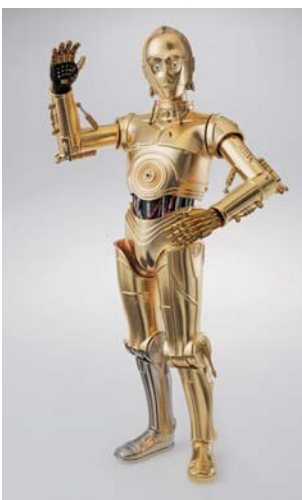
▲ The figure's Chogokin® specifications provides a solid, full-bodied design that can be appreciated when held in the hand.

Standing 12-inches tall with a full-bodied design through Chogokin®, or die cast super alloy material—the ultimate collector's item offering outstanding authenticity