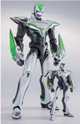
▲ (Size Comparison) Back: 12-inch 12™ PM Wild Tiger; Front: 14-cm S.H. Figuarts Wild Tiger (Price JPY 4,725; on sale)

Stands 12 inches tall, featuring an expansive range of movement and light-effect apparatus—Revisit all manner of memorable scenes with thrilling action poses