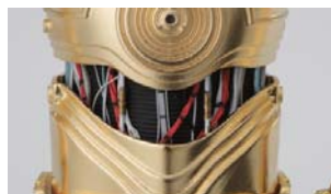
▲Each cord running along the mid-torso section is a separate part.