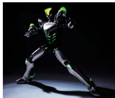
▲The figure's larger size has enabled it to be fitted with numerous LEDs and batteries. Users can enjoy the same light effects as those seen in the animation series together with thrilling action poses.

During the same period as the launch of 12™ PM Wild Tiger, Bandai will begin accepting advance orders for 12™ PM Kotetsu T. Kaburagi (orders will be accepted from September 1, 2012; JPY 18,900, including tax), a 12-inch action figure of Kotetsu T. Kaburagi, the main character of TIGER & BUNNY. These orders will be accepted at the Tamashii Web Shop ( http://p-bandai.jp/tamashiwebshouten/ ) in Premium Bandai, Bandai's official shopping site with product delivery planned for around March 2013.