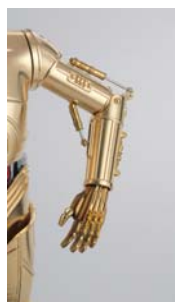
▲The elbow cylinder expands and contracts with elbow movement.

The theme for this figure was to develop “the world's most precise C-3PO figure.” To create a precise reproduction, Bandai thoroughly studied the features of C-3PO in the Star Wars film down to the finest detail, from C-3PO's horizontally asymmetric body details to indentations and distortions, as well as the light effects of its eyes.